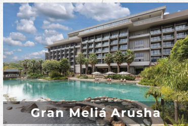
Gran Meliá Arusha