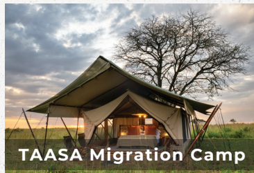
TAASA Migration Camp