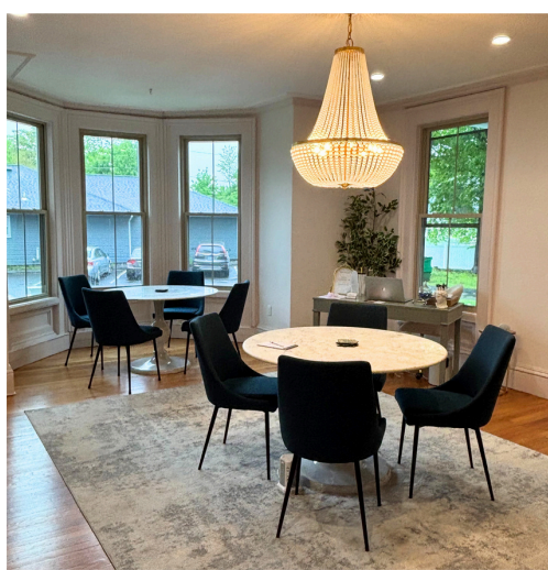
DOWNSTAIRS $100/hr • $650/day

Includes Calliope Conference Room, Kitchen, & open areas.