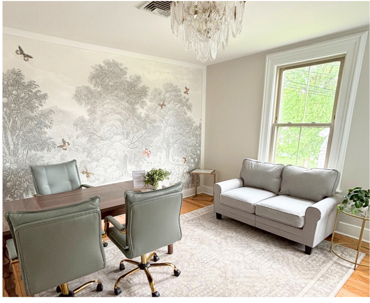
CLIO Private Meeting Room & Day Office (2-5 people)

Great for confidential conversations, video calls, or focused work sessions