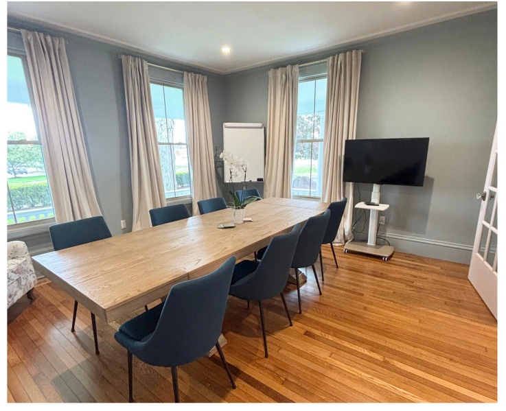
CALLIOPE - Conference Room (10-12 people)

Large screen, whiteboard, natural light. Ideal for presentations, workshops & collaboration