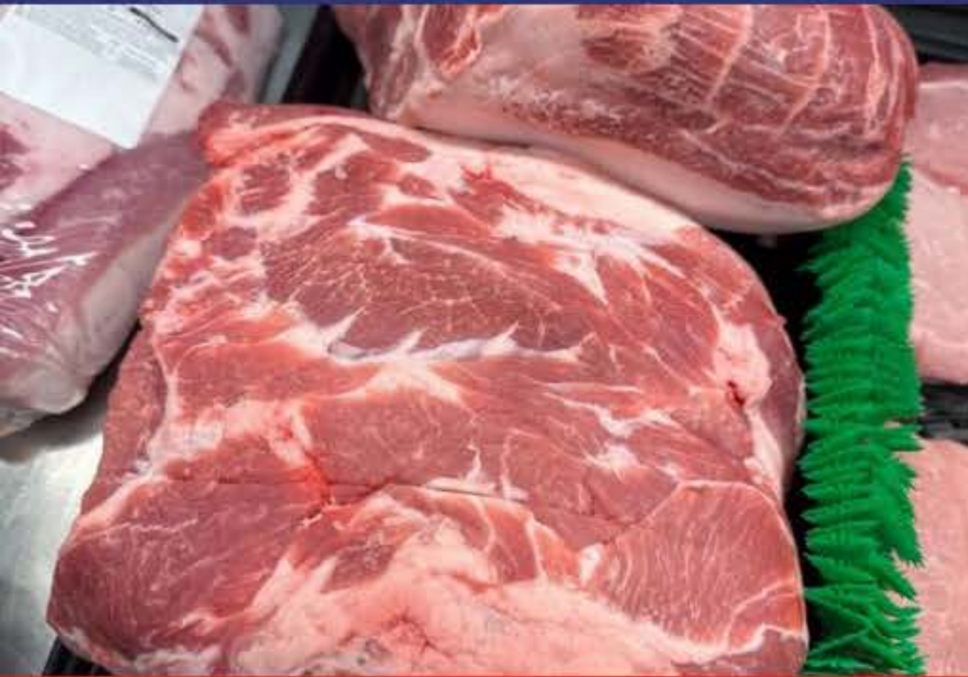
Bone-In Pork Butts $1.99/lb

DURING BREAKFAST HOURS: GET 1/2 OFF ICED COFFEE EVERY DAY!