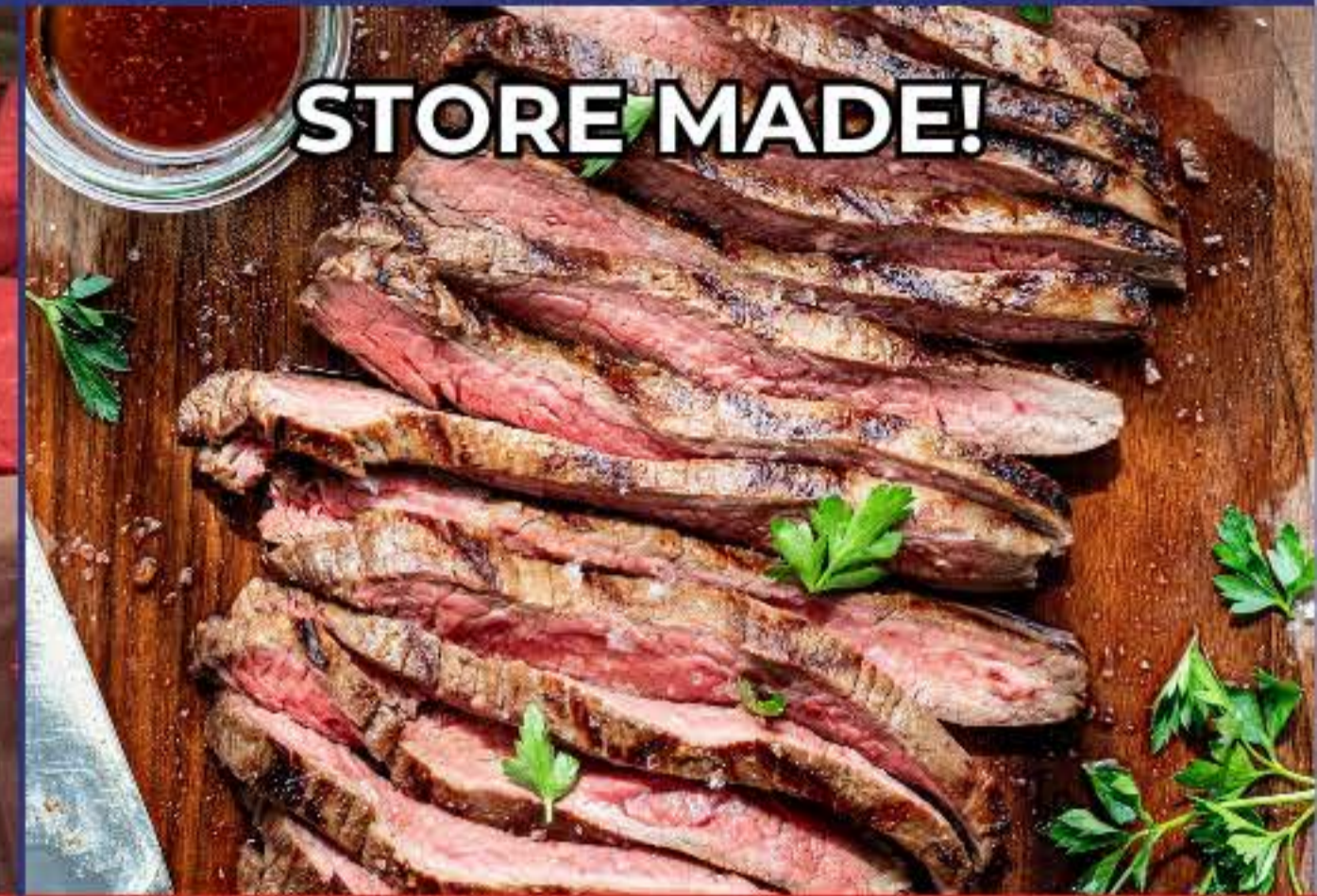
Marinated Flank Steaks $13.99/lb

Weaver's of Wellsville Ring Bologna $5.49/lb