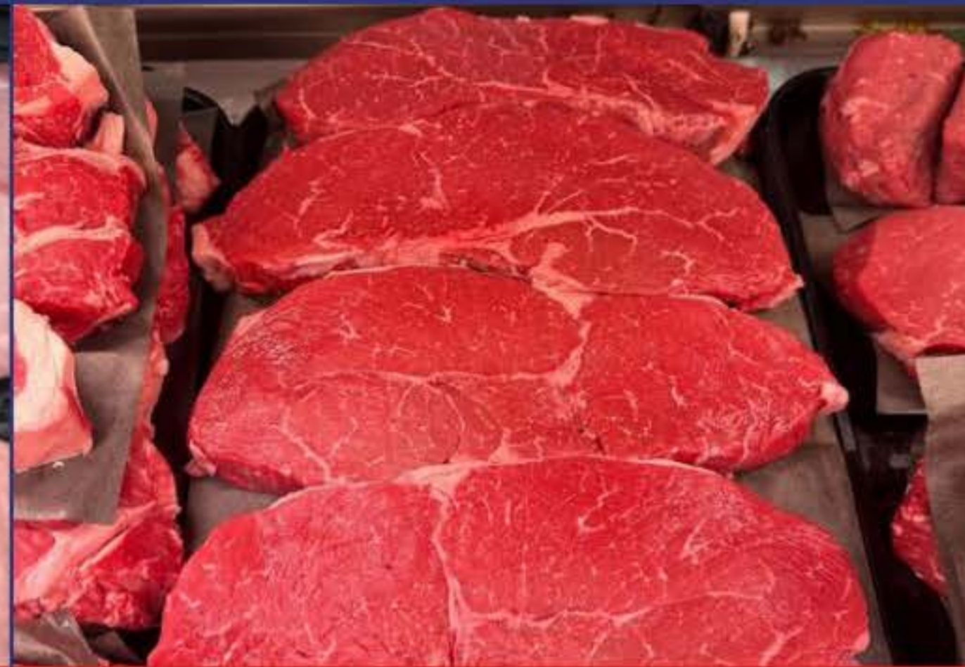
USDA Choice Sirloin Steak $8.99/lb