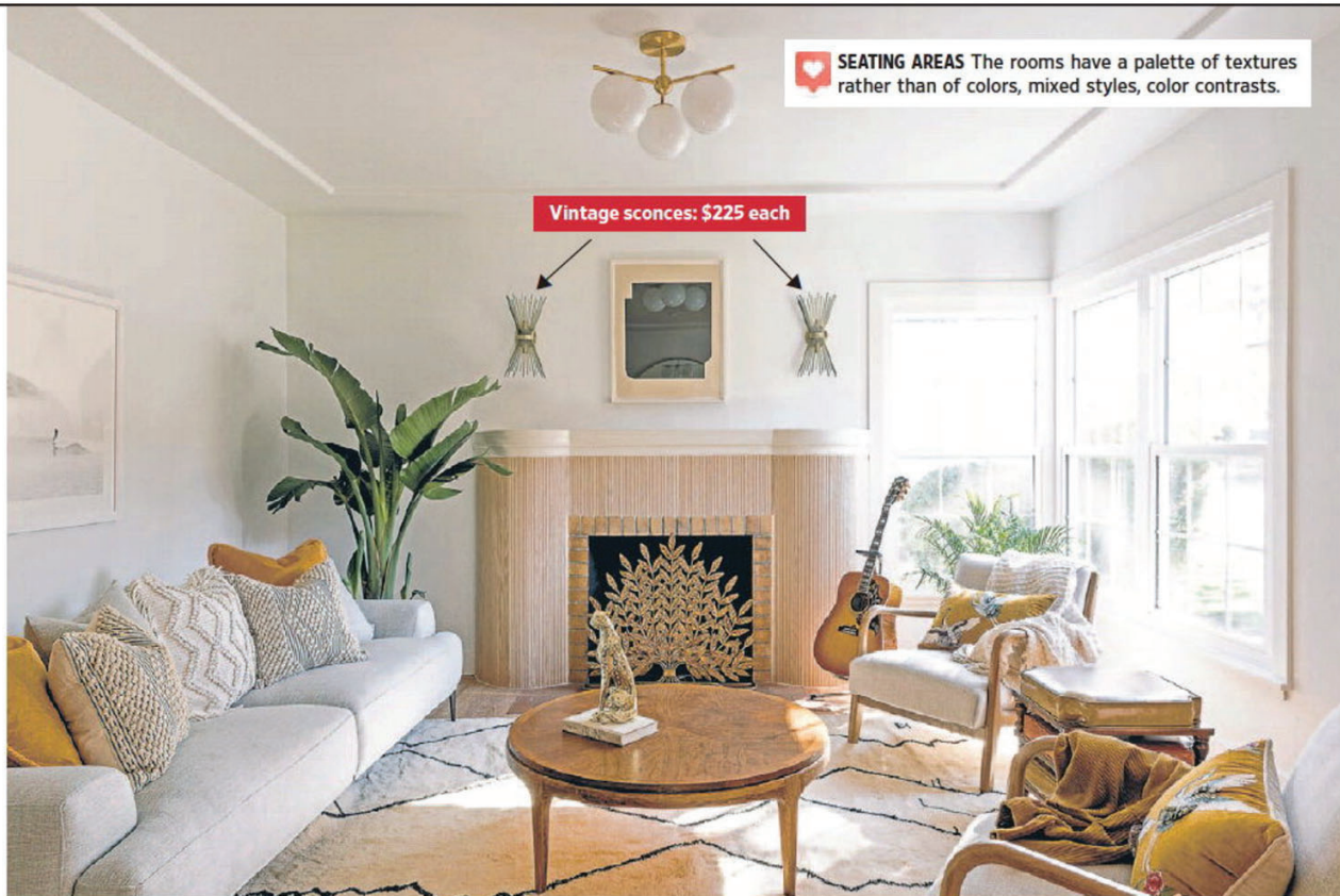
SEATING AREAS The rooms have a palette of textures rather than of colors, mixed styles, color contrasts.

He says homeowners are upping spending on areas that don't have a wow factor for visitors. They