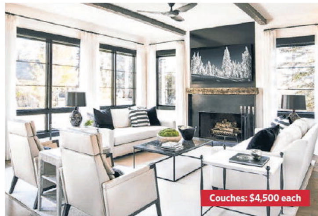
Couches: $4,500 each

want top-of-the-line HVAC systems, in an effort to make indoor life safer and more comfortable. Other choices are solid-wood doors for quiet, and custom, built-in storage throughout for more space.