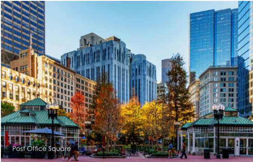
Post Office Square