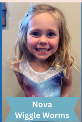
Nova Wiggle Worms