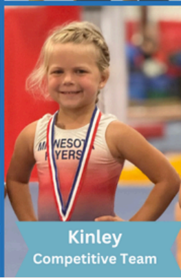
Kinley Competitive Team