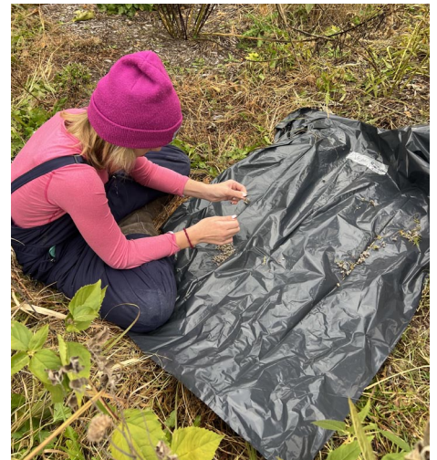
A student from Adeline Montessori School collects seeds for processing and storage in a seed bank, a collaborative project with Waukesha County Land Conservancy (WCLC).