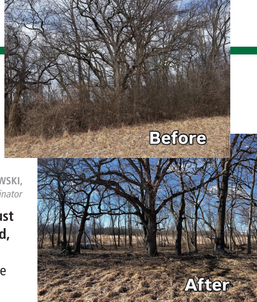
Before and after restoration images of the woodland area at Ravensholme.

Before restoration, movement through some portions of the woodland was almost impossible with the dense brush. The soil was lifeless, and the lower limbs of legacy oaks were dwindling from lack of sunlight. Thankfully, the brush removal has transformed the space. Staff have already seen more birds enjoying the liberated woodland as they glide amongst the towering oaks,