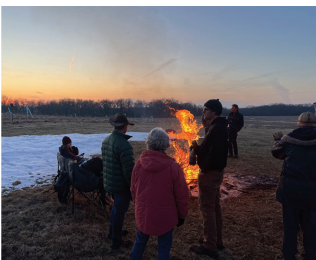
TPC's first event in the Third Thursday series featured sunset views overlooking the Fox River and a bonfire celebrating the Spring Equinox at Ravensholme on the River. The series continues throughout the year and features fun and unique tours of protected land throughout the region.

land, history, and natural features that make this all worth protecting. Visit our website to see more information on upcoming events and we look forward to having you join us!