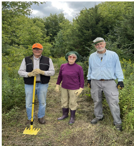
Volunteers help build hiking trails at our publicly accessible Saeger Preserve in Lac La Belle. TPC is fundraising to build a boardwalk to connect the trail system across a wetland and improve access for all users.

We advanced restoration efforts across several preserves, improving ecological health and biodiversity. From creating pollinator habitat at Ravensholme on the River, to enhancing wetlands with the Oconomowoc Watershed Protection Program (OWPP), and continuing work with American Bird Conservancy (ABC) to restore rare oak savanna systems – one of the most threatened ecosystems in the world – these efforts are helping to rebuild habitat, support pollinators, and improve water quality throughout the watershed.