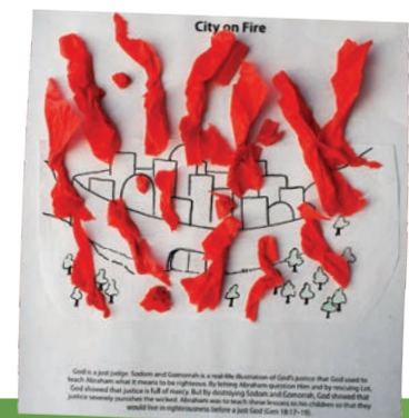
City on Fire See Year 1 Craft Book, Book 1

Directions: Pass out a city outline cutout to each child and ask children to color the city with crayons. Pass out a background page to each child. Have children glue the colored city outline onto the background. Help children tear strips of colored tissue paper and glue them onto the background page. Roll up some pieces of tissue paper into marble size balls and glue them on the page as well.