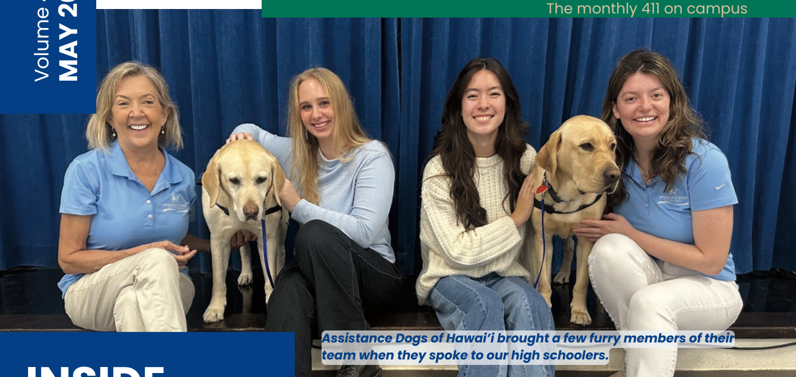
Assistance Dogs of Hawai'i brought a few furry members of their team when they spoke to our high schoolers.