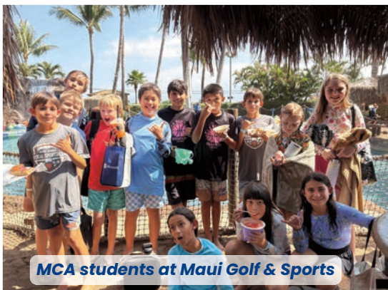
MCA students at Maui Golf & Sports